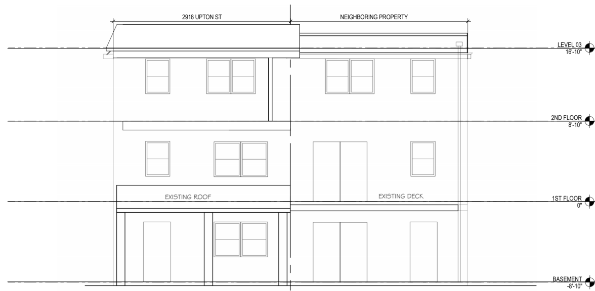
1 REAR (SOUTH) ELEVATION - EXISTING P-03 SCALE: 3/16" = 1'-0"