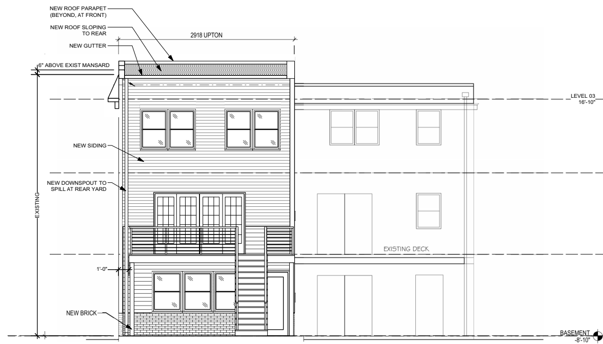
3 REAR (SOUTH) ELEVATION - NEW P-03 SCALE: 3/16" = 1'-0"